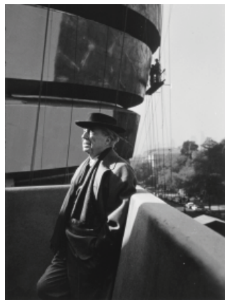
Photo to Right: Frank Lloyd Wright during construction of the Solomon R. Guggenheim Museum, New York, ca. 1959

Cover Photo: Solomon R. Guggenheim Museum, New York, 1943–59, Exterior view.