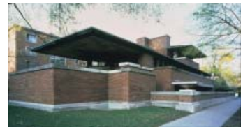
Frederick C. Robie House (1906)

The 10 Wright buildings included in its nomination are: