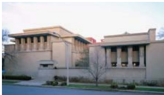
Unity Temple (1904)