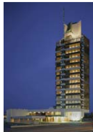
Price Tower (1952) Photo courtesy of Christian Korab, 2003